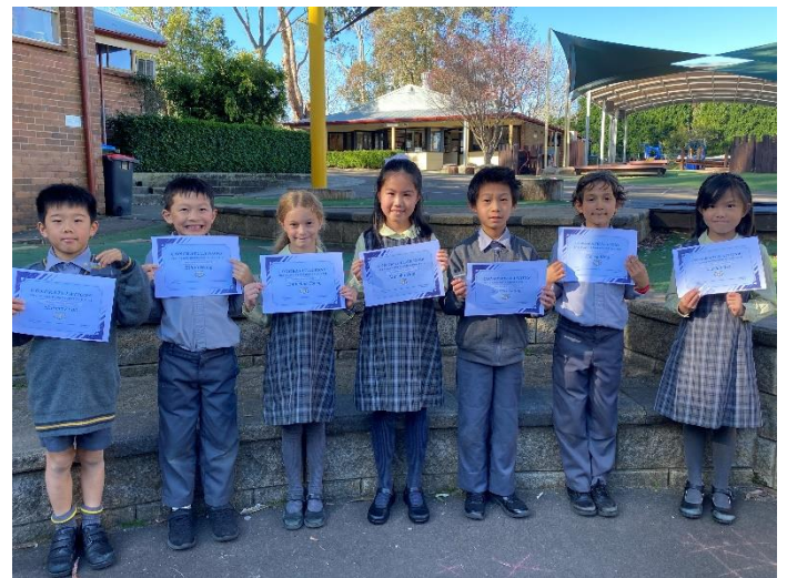
Year 2 SRC Representatives