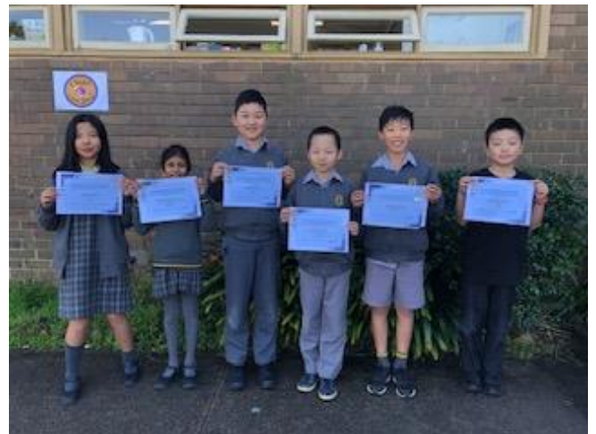
Year 4 SRC Representatives