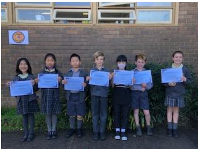
Year 3 SRC Representatives