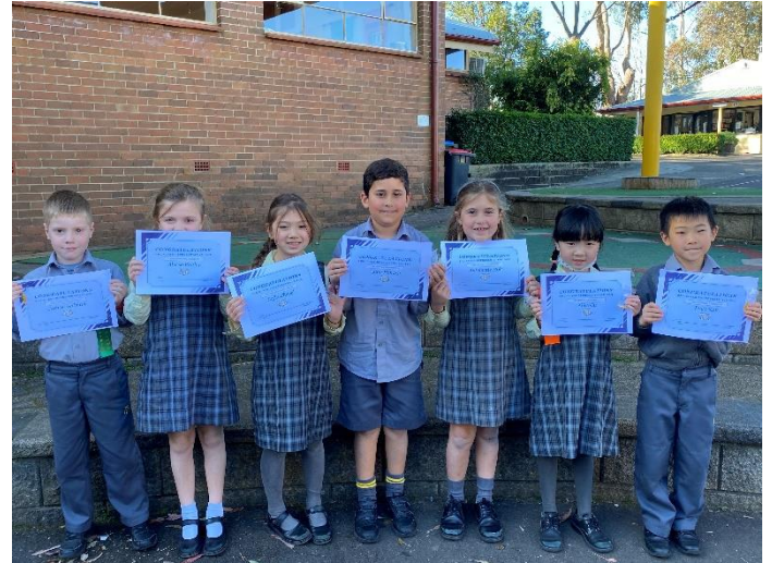
Year 1 SRC Representatives