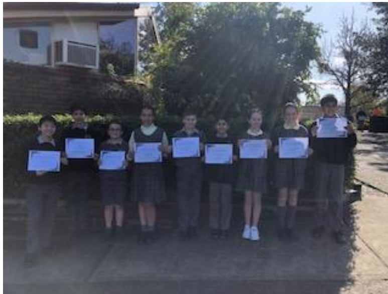
Stage 3 SRC Representatives